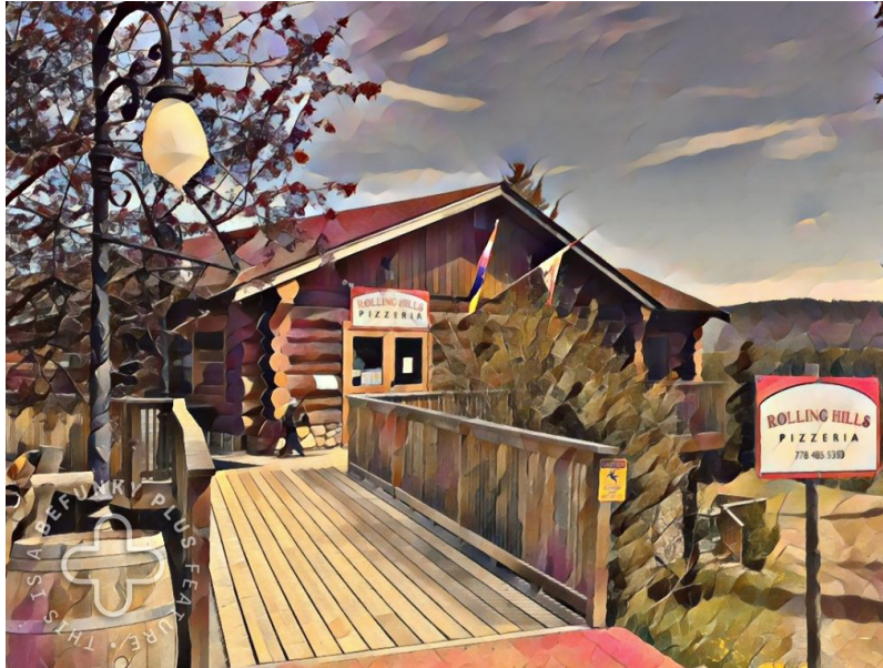
Upper (Main) Entrance : Restaurant & Retail Sales

The 108 Hills - This building is currently leased by the Groundwork Community Service Cooperative to provide a physical space as a community hub for the Real Life Network.