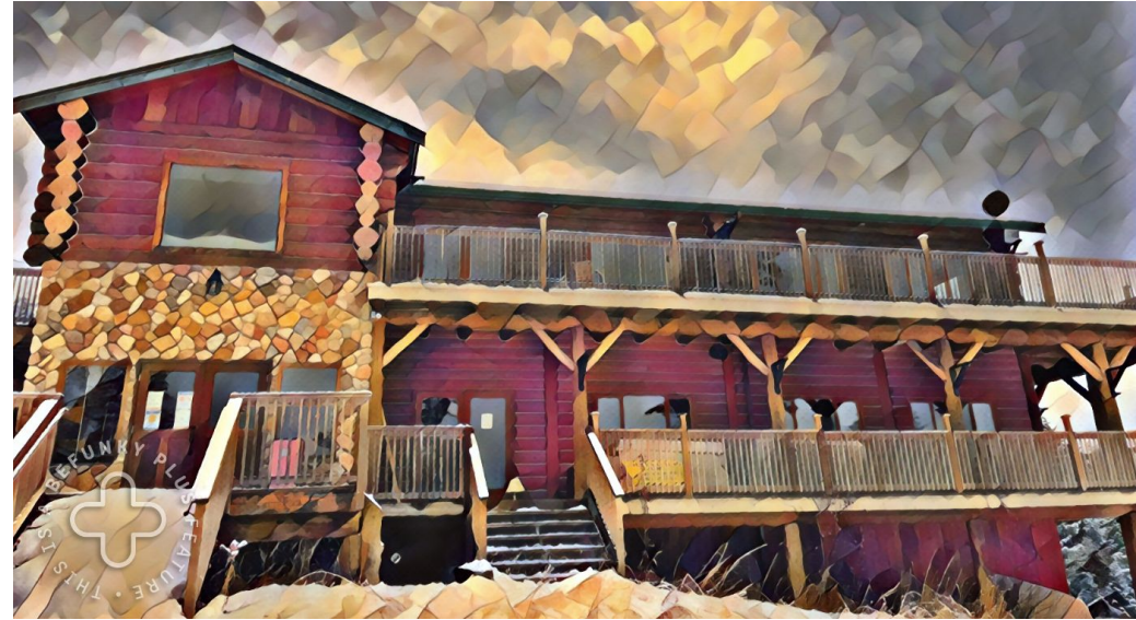
Lower Entrance(s) : Tavern & Ski Rental Sales Facilities